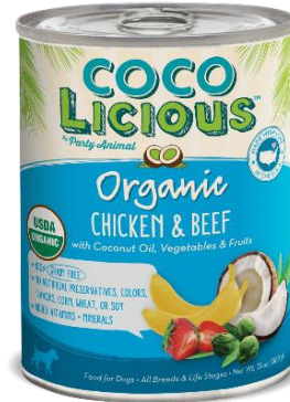
Item #1344 Cocolicious Dog Chicken & Beef 13 oz.